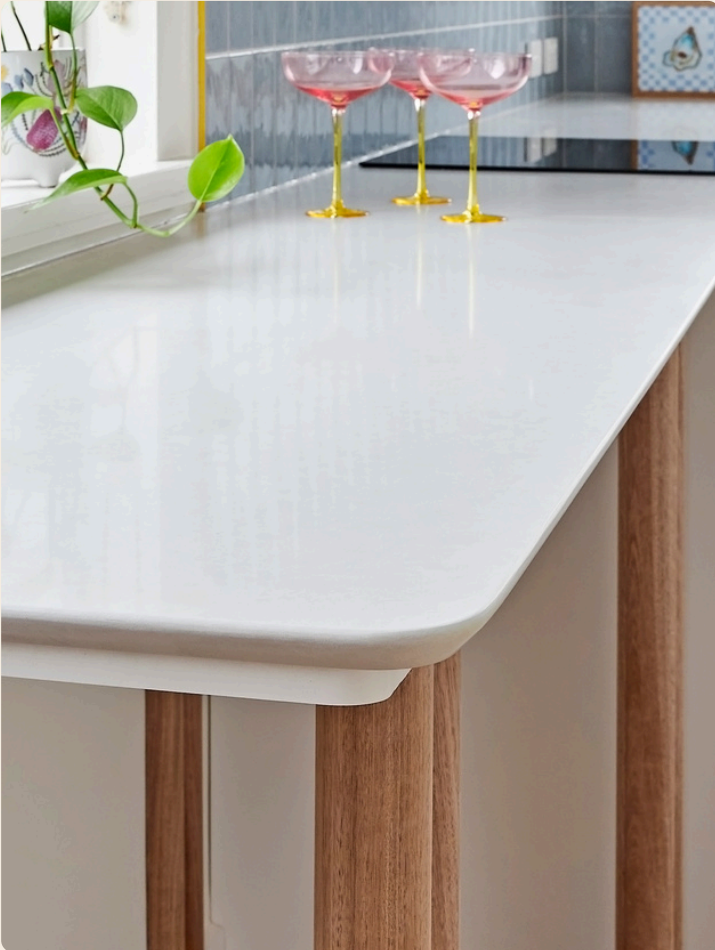
realzar project | st. georges

Often overlooked, benchtop profiles are emerging as quiet design heroes, adding depth, craftsmanship, and architectural detail across kitchens, bathrooms, and laundries. From crisp edges to soft curves, they bring personality to even the most restrained spaces.